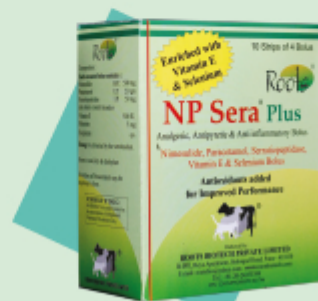
Pack : 10 X 4 bolus strip